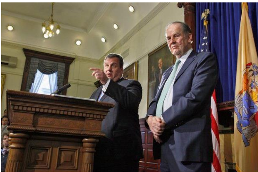
Gov. Chris Christie (left) and former Gov. Tom Kean are shown in this 2011 file photo.

If you are a Christie friend or foe at any level, just like it helps when Obama is in the game to remember who he really is; it helps to remember when Christie is in the game, the game is all about Christie. Once you give your help or support or you take some help and support—that is it.