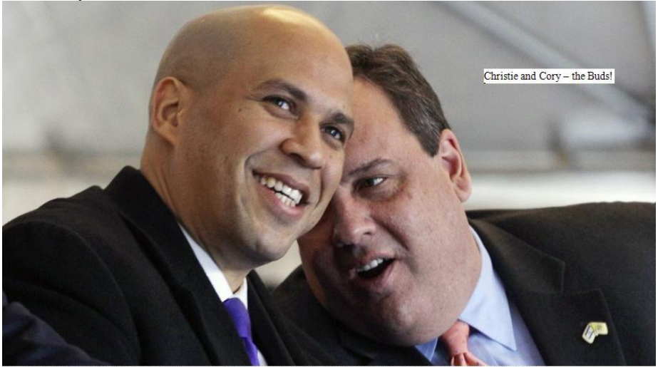
New Jersey Gov. Chris Christie isn't going to help Cory Booker's GOP opponent, outside a formal endorsement.

Governor Christie enjoys getting support from Republicans and conservatives so that he can win elections. Unfortunately, he has not been so willing to give what he has received.