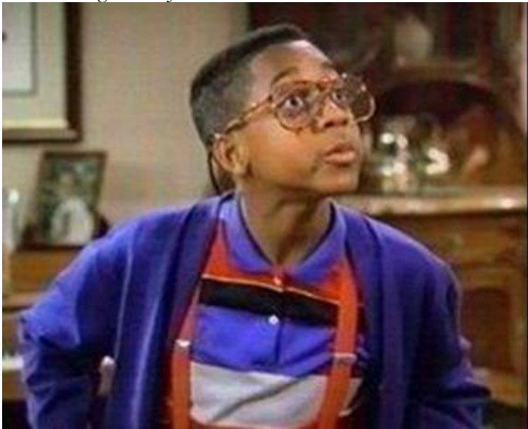
Figure 9-1 Jaleel White as the Real Steve Urkel