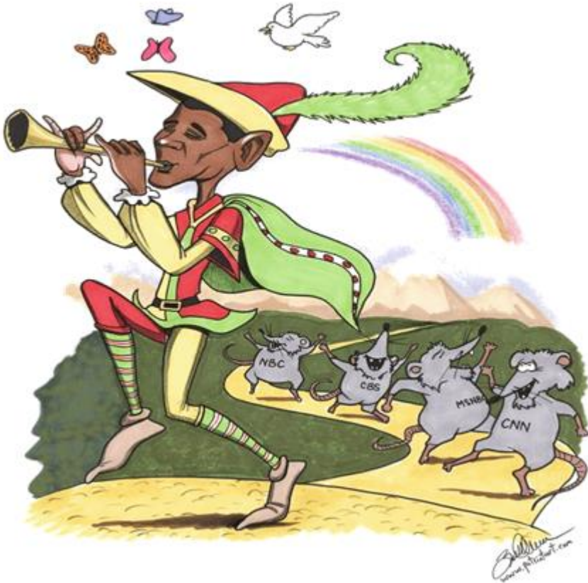
Figure 5-1 The Pied Piper of the Media