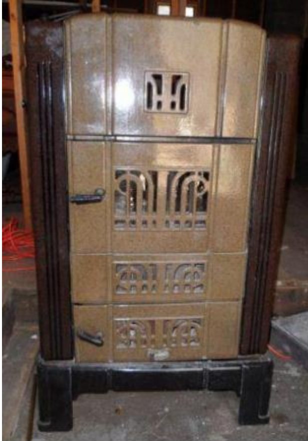
Figure 17-1 Heatrola Coal Stove – A Dining Room Mainstay

Coal is clearly dangerous in terms of mining and then, though we have burned it for many years, there are those environmentalists who are warm in their own surrounds, who would swear we are better off freezing to death than using coal. Yes, coal is a pollutant for miners and for those that burn it and for those who breathe in the chimney fumes. Some statistics say that coal-fired power plants shorten nearly 24,000 lives a year in the United States, including 2,800 from lung cancer. No statistics show the death rate for no heat in the winter. Clearly, the coal stats as presented are terrible and we ought to figure out how to make this better. Shutting off the lights and the heat and bringing frozen bodies from homes after the winter to the undertaker in the spring is not the answer. Not having energy will not help us solve this problem and it would clearly cause more deaths than the number caused by using coal energy effectively.