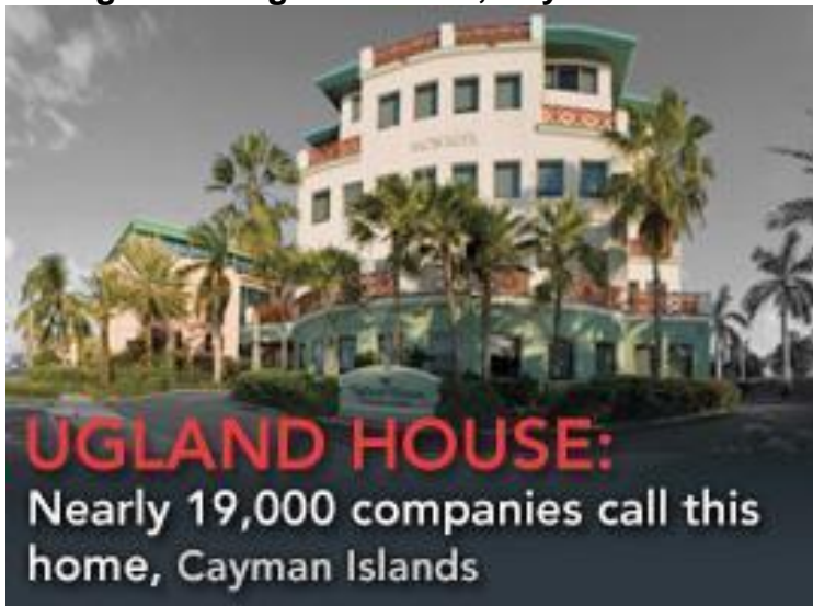
Figure 6-1 Ugland House, Cayman Islands

“Nearly 19,000 global corporations have a mail drop at Ugland House, a single building in the Cayman Islands. Ugland House is the legal address of these overseas corporate subsidiaries, many set up for the purposes of avoiding taxes.” Individuals simply cannot get the tax deals that corporations get, though they can try. Clearly everybody’s special deal must end.