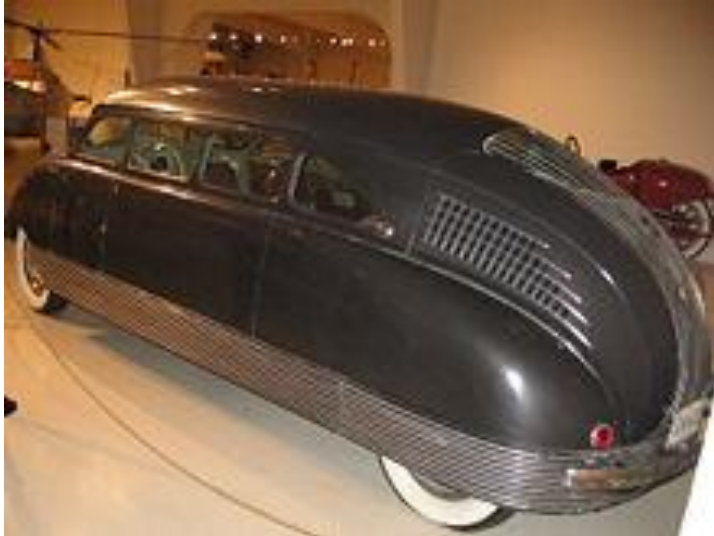
1935 Stout Scarab