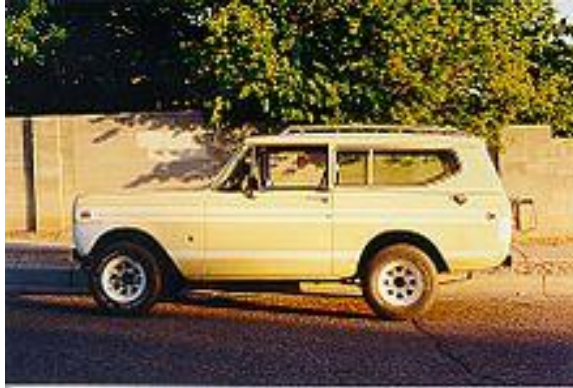
1978 International Harvester Scout II

The International Harvester Company (abbreviated first IHC and later IH ) today known as Navistar International Corporation, was a United States agricultural machinery, construction equipment, vehicle, commercial truck, and household and commercial products manufacturer.