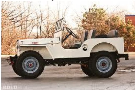
A classic Willys Jeep – the kind the Army used

Willys was the brand name used by Willys-Overland Motors, an American automobile company best known for its design and production of military Jeeps (MBs) and civilian versions (CJs) during the 20th century. Willys was bought by Kaiser and their name was changed in 1963.