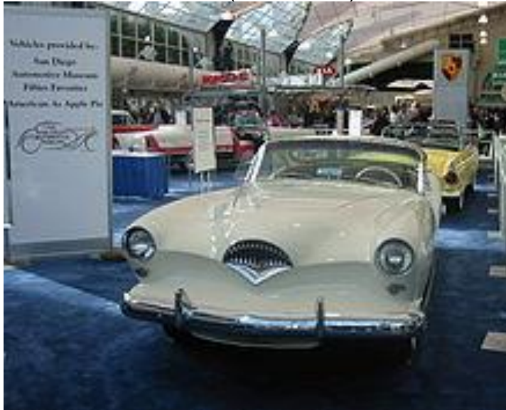
1954 Kaiser Darrin

Kaiser-Frazer Corporation's first car was launched for the 1947 model year. Known as the Kaiser Special, it was a four door sedan with a six cylinder engine. These two cars (with the Frazer) had the first true postwar sheet metal with enveloped bodies and fender lines that ran front to rear in an unbroken contour.