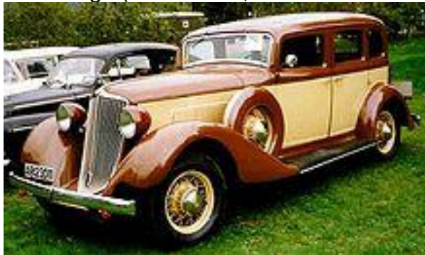
1932 Graham Blue Streak