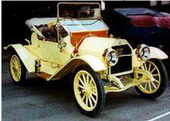
1912 EMF Model 30 Roadster