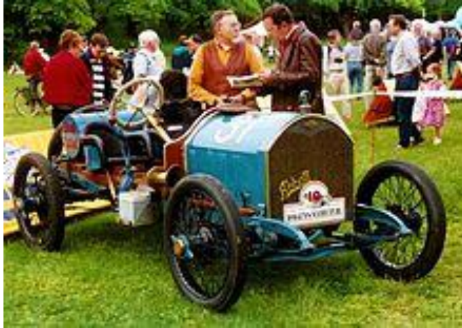
1911 Abbot Detroit

Founded in 1909 in Detroit, the Abbott Motor Car Company and its successors were typical early manufacturers assembling purchased components like Continental engines in proprietary frames and bodies. In Abbotts case the formula proved to be successful, achieving some success in production car competition and producing just over 1,800 cars in 1912 while sustaining a more normal rate of 4-5 cars per working day (you didn't get Saturdays off in the Teens) for most of its life.