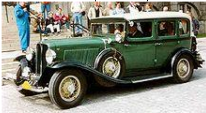
1932 Auburn S-100 A