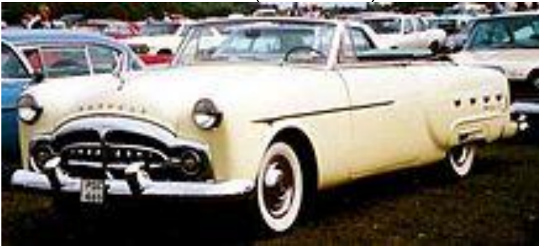
1951 Packard Convertible

Packard was an American luxury automobile marque built by the Packard Motor Car Company of Detroit, Michigan, and later by the Studebaker-Packard Corporation of South Bend, Indiana. The first Packard automobiles were produced in 1899, and the last in 1958