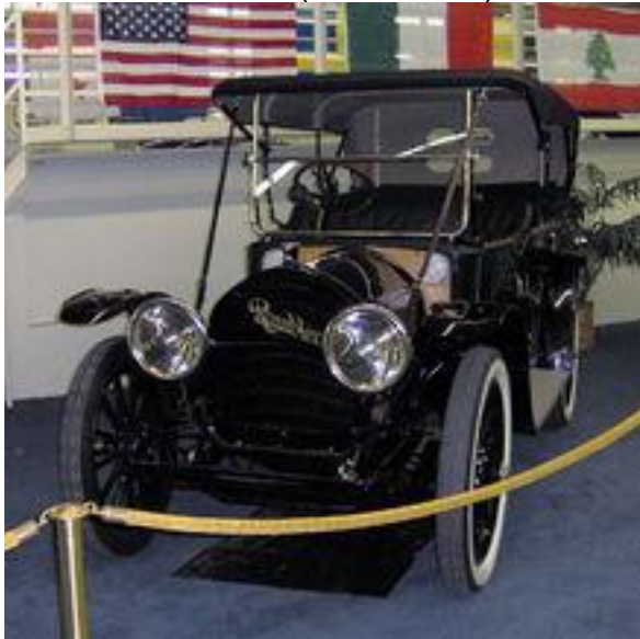
1913 Rambler 5 Passengers

Rambler was an automobile brand name used by the Thomas B. Jeffery Company between 1900 and 1914, then by its successor, Nash Motors from 1950 to 1954, and finally by Nash's successor, American Motors Corporation from 1954 to 1969. It was often nicknamed the "Kenosha Cadillac" after its place of manufacture.