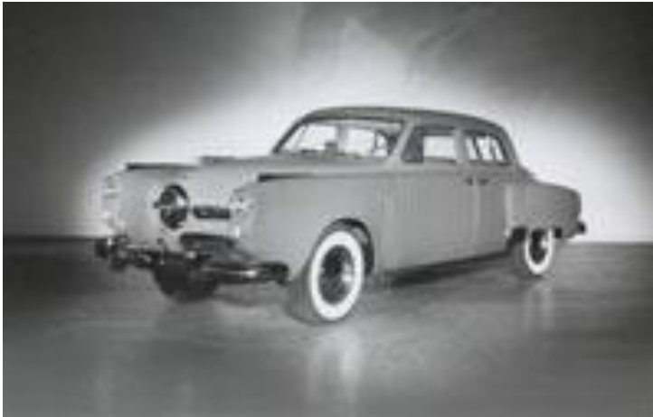
THE 1950 STUDEBAKER “BULLET NOSE” LAND CRUISER

Besides the beautiful 1916 Studebaker shown above, the company had some other novel notions such as the Bullet Nose Models as shown below: