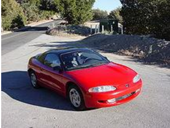
1995 Eagle Talon

The AMC Eagle was a compact-sized four-wheel drive passenger vehicle that was produced by American Motors Corporation (AMC). The AMC Eagle line of vehicles inaugurated a new product category of "sport-utility" or crossover SUV. Introduced in August 1979 for the 1980 model year, the coupe, sedan, and station wagon body styles were based on the AMC Concord.