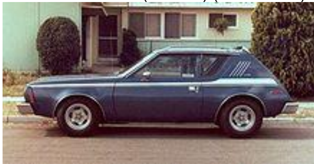
1974 AMC Gremlin

American Motors Corporation (AMC) was an American automobile company formed by the 1954 merger of Nash-Kelvinator Corporation and Hudson Motor Car Company. At the time, it was the largest corporate merger in U.S. history