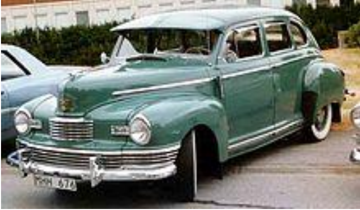
1946 Nash 4-door Sedan

Nash Motors Company was an American automobile manufacturer based in Kenosha, Wisconsin, in the United States from 1916 to 1937. From 1937 to 1954, Nash Motors was the automotive division of the Nash-Kelvinator Corporation. Nash production continued from 1954 to 1957 after the creation of American Motors Corporation.