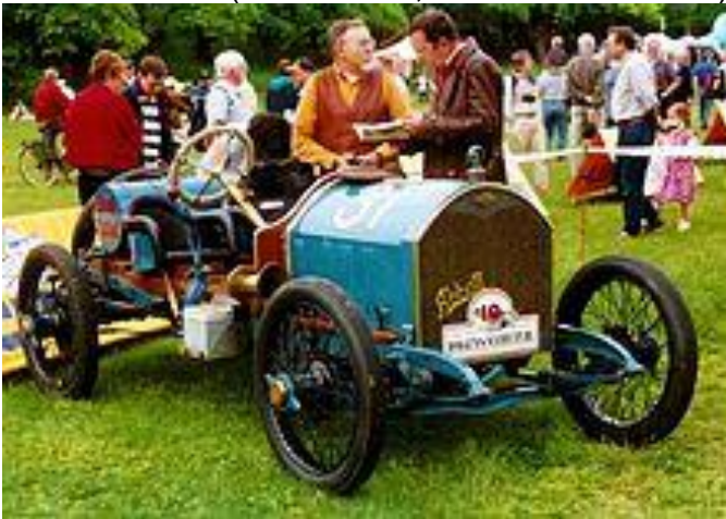
1911 Abbot Detroit

Founded in 1909 in Detroit, the Abbott Motor Car Company and its successors were typical early manufacturers assembling purchased components like Continental engines in proprietary frames and bodies. In Abbots case the formula proved to be