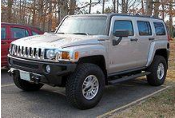
2010 Hummer H3

AM General introduced Hummer and later was taken over by GM. The brand was a casualty of government bailout of GM. The HUMVEE is still made by AM General. GM could not sustain its profits and make the H2, and H3 Hummer units. After not being able to sell the brand, GM, Government Motors, exited the marketplace.