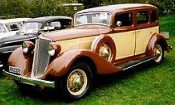
1932 Graham Blue Streak

Graham-Paige (1928–1930; Graham 1930–1947)