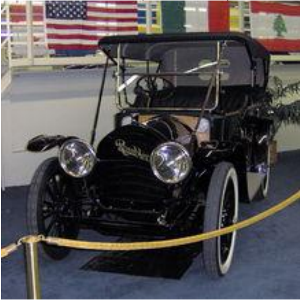
1913 Rambler 5 Passengers

Rambler was an automobile brand name used by the Thomas B. Jeffery Company between 1900 and 1914, then by its successor, Nash Motors from 1950 to 1954, and finally by Nash's successor, American Motors Corporation from 1954 to 1969. It was often nicknamed the "Kenosha Cadillac" after its place of manufacture.