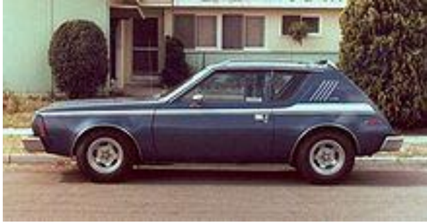
1974 AMC Gremlin

American Motors Corporation (AMC) was an American automobile company formed by the 1954 merger of Nash-Kelvinator Corporation and Hudson Motor Car Company. At the time, it was the largest corporate merger in U.S. history