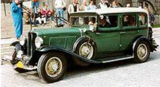
1932 Auburn S-100 A