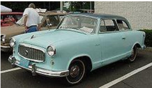
Nash Rambler Almost beep beep