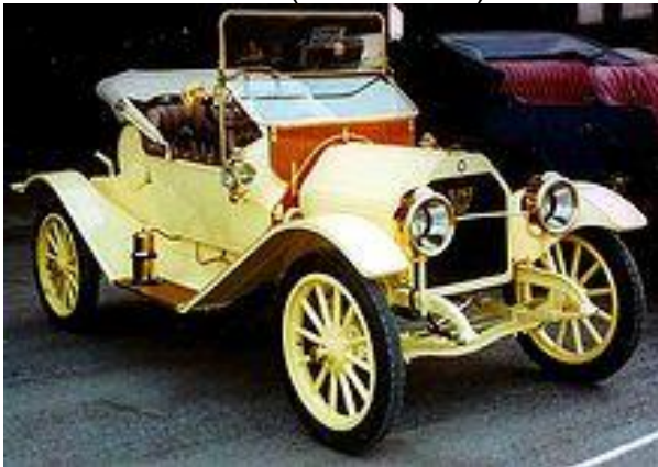
1912 EMF Model 30 Roadster