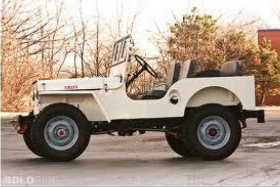
A classic Willys Jeep – the kind the Army used

Willys was the brand name used by Willys-Overland Motors, an American automobile company best known for its design and production of military Jeeps (MBs) and civilian versions (CJs) during the 20th century. Willys was bought by Kaiser and their name was changed in 1963.