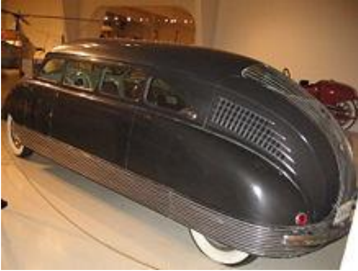
1935 Stout Scarab