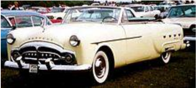
1951 Packard Convertible

Packard was an American luxury automobile marque built by the Packard Motor Car Company of Detroit, Michigan, and later by the Studebaker-Packard Corporation of South Bend, Indiana. The first Packard automobiles were produced in 1899, and the last in 1958