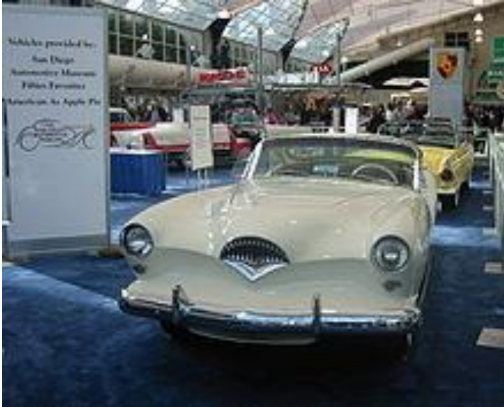
1954 Kaiser Darrin

Kaiser-Frazer Corporation's first car was launched for the 1947 model year. Known as the Kaiser Special, it was a four door sedan with a six cylinder engine. These two cars (with the Frazer) had the first true postwar sheet metal with enveloped bodies and fender lines that ran front to rear in an unbroken contour.