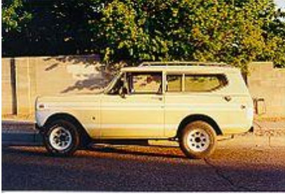
1978 International Harvester Scout II

The International Harvester Company (abbreviated first IHC and later IH) today known as Navistar International Corporation, was a United States agricultural machinery, construction equipment, vehicle, commercial truck, and household and commercial products manufacturer.