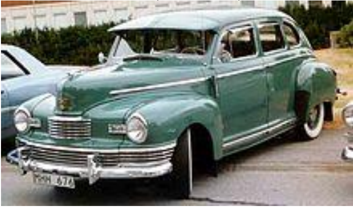
1946 Nash 4-door Sedan

Nash Motors Company was an American automobile manufacturer based in Kenosha, Wisconsin, in the United States from 1916 to 1937. From 1937 to 1954, Nash Motors was the automotive division of the Nash-Kelvinator Corporation. Nash production continued from 1954 to 1957 after the creation of American Motors Corporation.