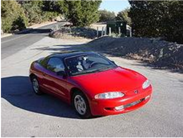
1995 Eagle Talon

The AMC Eagles were the only four-wheel-drive passenger cars produced in the U.S. [1] They were affordable cars offering a comfortable ride and handling on pavement together with superior traction in light off road use through AMC's innovative engineering and packaging.