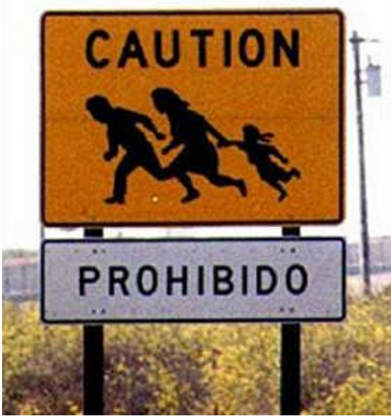
Figure 15-1 Caution Illegal Immigrants Prohibited

Is this a lie, a deception, a failure to follow the Constitution or something else? It sure isn't honest government.