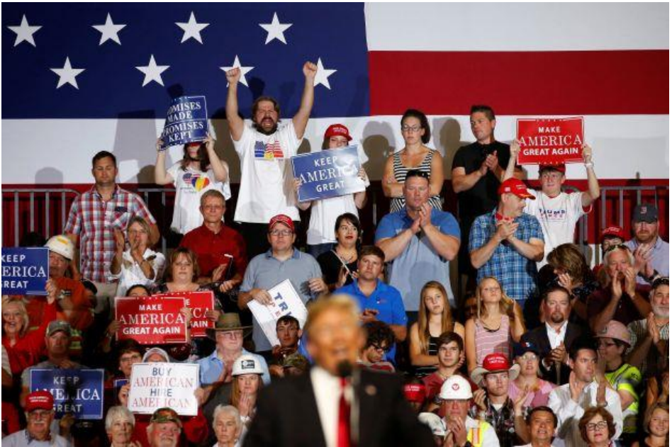
Supporters cheer as President Donald Trump speaks in Great Falls, Mont., on July 5. Among Republicans, his job approval rating stands at 88%.

Though some felt when you ran in 2016 that you were not a viable candidate at the beginning, I was not among their ranks. I saw you grow from day one, when you were introduced to the piranha at the first Republican primary debate. You did very well but nobody would acknowledge you because you were and continue to be the biggest threat to all of the establishment elites in both parties that has ever existed. You are especially not liked by the corrupt press because you call them out on their dishonesty. Thank you, President Trump.