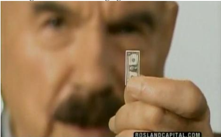
Figure 12-1 The Changing Size of the Dollar Bill

This picture above was taken in 2010 and inflation has not stopped in between then and now. Think of the dollar continually getting smaller like the Incredible Shrinking Man. Perhaps one day, even tweezers will not be small enough to pay a dollar for a dollar's worth of what once was penny candy?