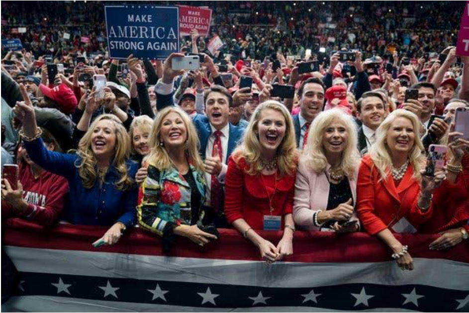
Now, these ladies really are cute

I respect Donald Trump. I don't just like him, I think he is a special guy. He was not necessarily the best teenager or young adult, but he did not run for President in his twenties. How many of us would pass the "good guy" test before we matured? Trump always had more than anybody else so we might suggest he had a tougher time being normal than normal people. He always had more money than anybody else. He was taller. He was better looking. He was smarter. In life, in many ways, Donald Trump was better in many ways than most. And, yes he learned it and yes, he knew it.