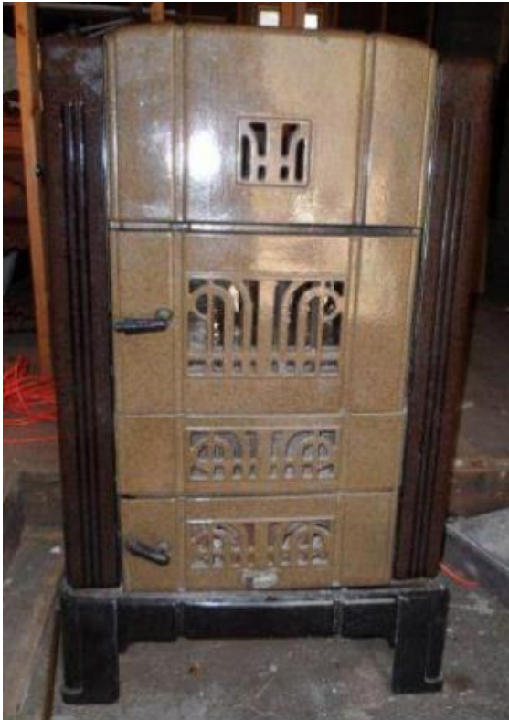
Figure 17-1 Heatrola Coal Stove – A Dining Room Mainstay

Coal is clearly dangerous in terms of mining and then, though we have burned it for many years, there are those environmentalists who are warm in their own surrounds, who would swear we are better off freezing to death than using coal. Yes, coal is a pollutant for miners and for those that burn it and for those who breathe in the chimney fumes. Plus there are ashes, which many like to put in their gardens. Yes, Adding moderate amounts increases crop yields and stabilizes