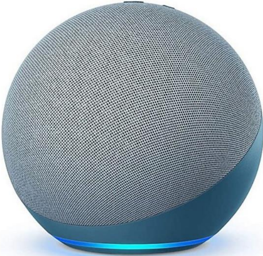
Amazon Echo (4 th Gen)

Voice control your entertainment - Stream songs from Amazon Music, Apple Music, Spotify, SiriusXM, and more. Plus listen to radio stations, podcasts, and Audible audiobooks.