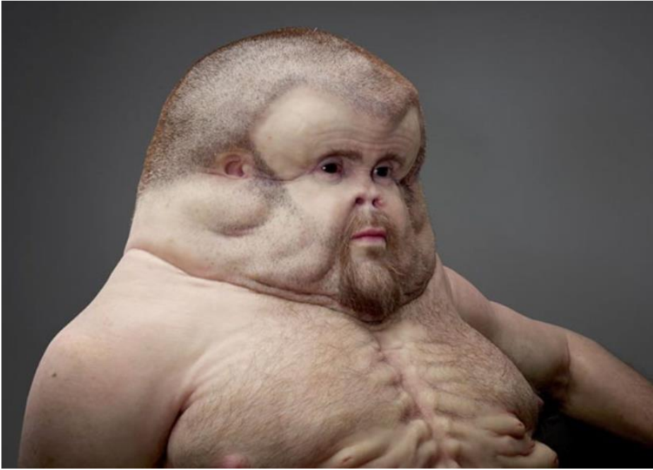
Graham – not a real person but an amalgam of what not using your body parts will bring.

One of my worst fears is that using just voice commands rather than arms and legs and hands and feet, after a while, thanks to Alexa, we might all evolve to look something like Graham—above. Whatever we need, we’ll just ask, and Alexa will provide.