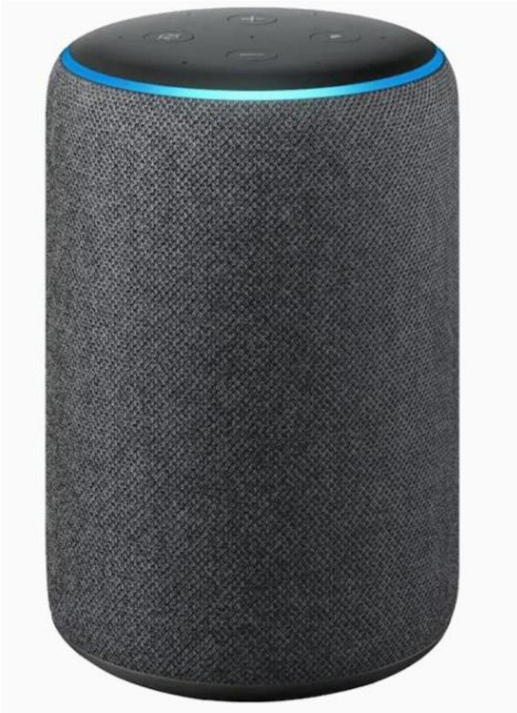
Echo (3rd Gen)- Smart speaker with Alexa

Voice control your smart home - Turn on lights, adjust thermostats, lock doors, and more with compatible connected devices.