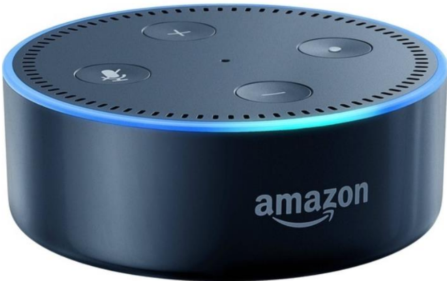
The Amazon Echo Dot 2

The picture on the next page is as Lewis and Clark would say is of a pioneer—an Amazon pioneer—the Echo 2. I have had one at home for two years. It came with my wife's iRobot. As great a product as the Echo Dot 2 is, Amazon is not alone in the race of high tech voice-enabled devices. Amazon may not be the only game in town anymore but the company is clearly #1 in the race.