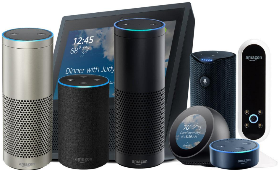
The Amazon Echo family at a point in me

Before you consider buying this great product, I must remind you that Amazon Echo is one of the most strategically planned products ever from Amazon and it is still in its infancy. Echo is the hardware and Alexa is the controlling brain. Amazon boasts of over 5000 developers and engineers working on this product to make it better, better, better.. ah! I am happy just using its voice recognition and musical connections and right now, at least, my personal Echo-lust goes no further.