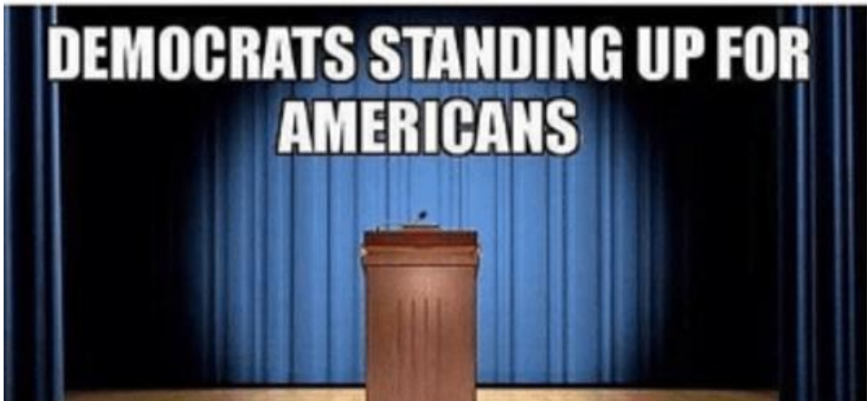
Isn't this a perfect way to show Democrat disregard for Americans

“They say the other side is energized. Let me tell you; they’re energized for hate for our president. They have a hatred for our