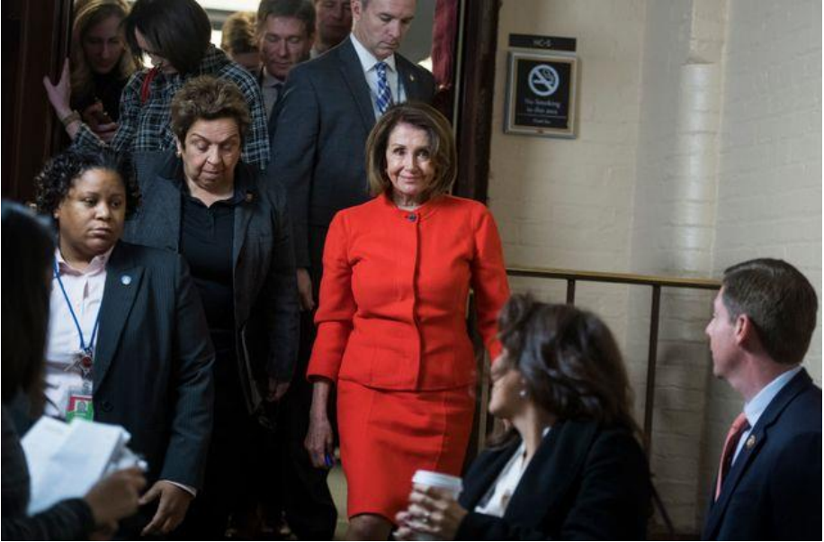
Wimps & Cowards in the Flesh