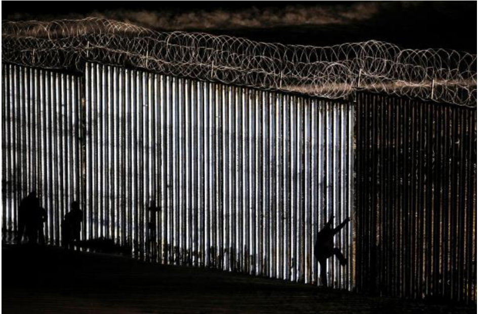
This Getty Image shows Migrants attempting to cross the border fence to the United States at Playa de Tijuana, Mexico.