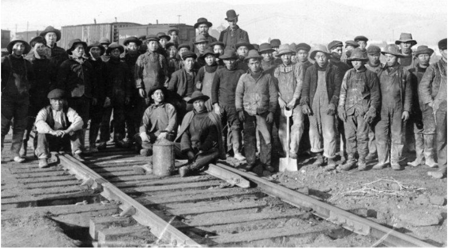
Chinese workers on the Transcontinental Railroad circa 1850