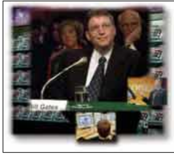
Figure 13-2 Bill Gates, Modern Robber Baron?