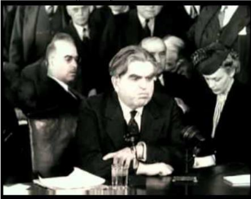
Figure 14-2 John L. Lewis C.I.O.

When Murray died in 1952, Walter Reuther, whose background was the United Auto Workers became the last president of the C.I.O before its merger with the A.F. of L. Clearly the AFL-CIO is the largest labor Union in America today at 13 million members.