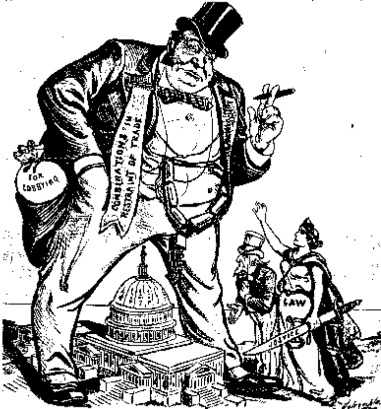
Figure 13-3 Good Old Fashioned Robber Baron Depiction (Web)

The railroad construction was planned by Theodore Judah. The Congress gave the OK in 1862 and some independent financing came from other magnates who participated in the building. They were known both as the Big Four and as the Associates. These four were Sacramento, California businessmen Leland Stanford, Collis Huntington, Charles Crocker, and Mark Hopkins. The group entrusted Crocker with the construction mission. Much of the labor was provided by Chinese workers, who like today's illegal foreign nationals, worked for a pittance.