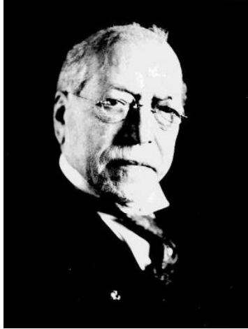
Figure 14-1 Samuel Gompers, President, AFL