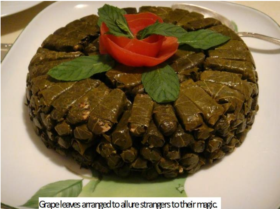
Grape leaves arranged to allure strangers to their magic.