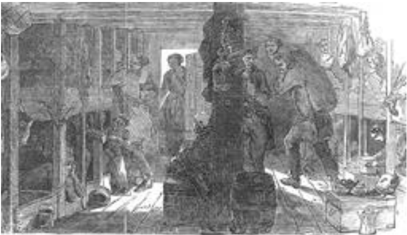
Illustrated London News, May 10, 1851 Courtesy of the Mariners' Museum

It was tough to afford a trip to America as one would expect. Many immigrants sailed to America or back to their homelands in what were called packet ships. These vessels carried mail, cargo, and people. Most crossed the ocean in what was called the steerage area , below decks. It was also known as third class. Conditions varied from ship to ship, but steerage was normally crowded, dark, and damp. Limited sanitation and stormy seas often combined to make it dirty and foul-smelling, too. Rats, insects, and disease were common problems.