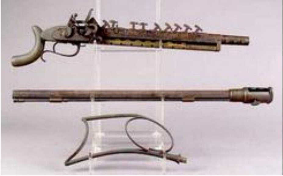
The Belton Flintlock

There was also the Italian-made Girandoni Repeating Air rifle, where a 22 high-capacity round magazine accurately could be fired within 30 seconds. This rifle used compressed air instead of gunpowder. It was used even after the revolution when Thomas Jefferson outfitted the members of the Lewis and Clark expedition.