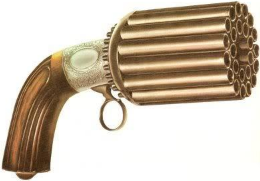
Pepper Box Revolver

revolvers. Some could hold over 20 rounds and were developed hundreds of years before the founding fathers. The pepperbox is shown below: