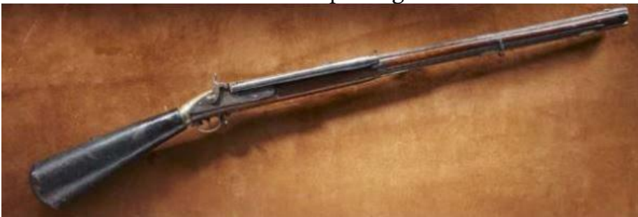
The Girandoni Repeating Air Rifle

Of course, there was also the Puckle Gun, which was a big early version of a Gatling gun created 60 years before the Revolutionary War. There were others such as the Pepper box