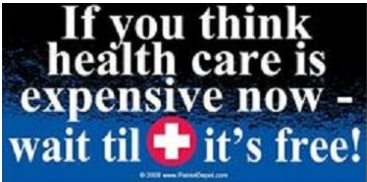
Figure 13-1 Bumper Sticker Found on Internet, Summer 2009

Sometimes it is good to drive arguments home ad absurdum. In this light, I present to you the bumper sticker of the year for 2009. See Figure 13-1.