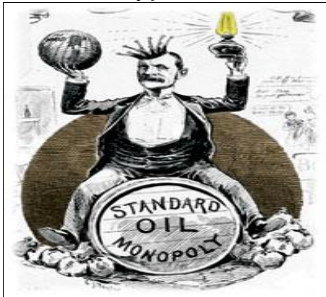
Figure 13-1 Standard Oil Monopoly - circa 1890

These were rich and very enlightened people, yet they were cutthroat competitors operating as entrepreneurs with minimal restrictions. They committed thinly veiled acts of stealing to improve their resources at the expense of their customers and employees. This is