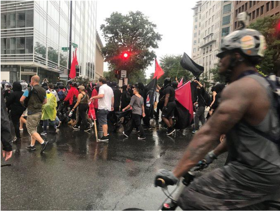
Pics of the March