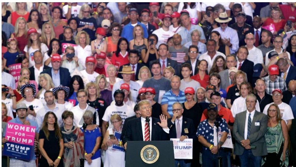
President Trump speaks to a crowd of supporters at the Phoenix Convention Center during a rally on Aug. 22, 2017

More than half of Whites — 55 percent — surveyed say that, generally speaking, they believe there is discrimination against white people in America today. Hershman's view is similar to what was heard on the campaign trail at Trump rally after Trump rally. Donald Trump catered to this white grievance during the 2016 presidential campaign and has done so as president as well. There is no place for racism in America but somehow Whitey has been left out of all the areas which offer protection from such abuse.